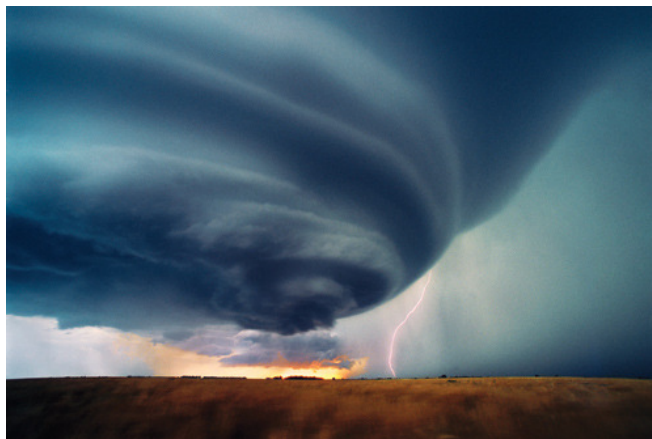
Extreme Weather fortunately

of the variety of events that the old Quaker Meeting House offers. It is one on Helmsley's pearls.