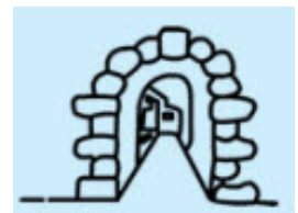
Helmsley Arts Center Logo