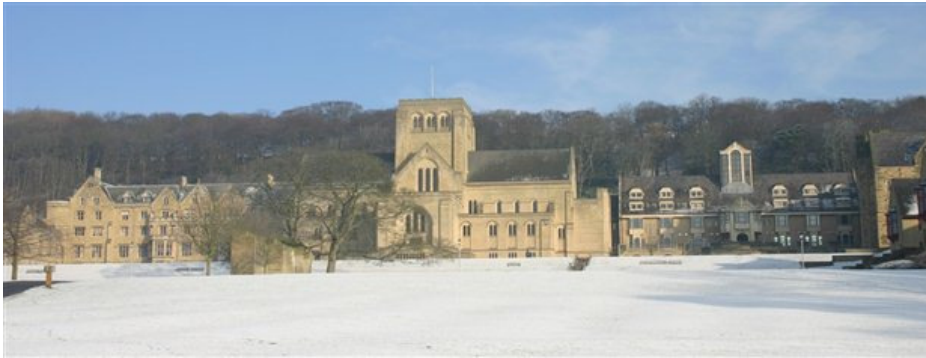
Ampleforth Abbey nr The Carlton Lodge

Marvellous looking building isn't it? Ampleforth Abbey in all its majesty on a winter's day.